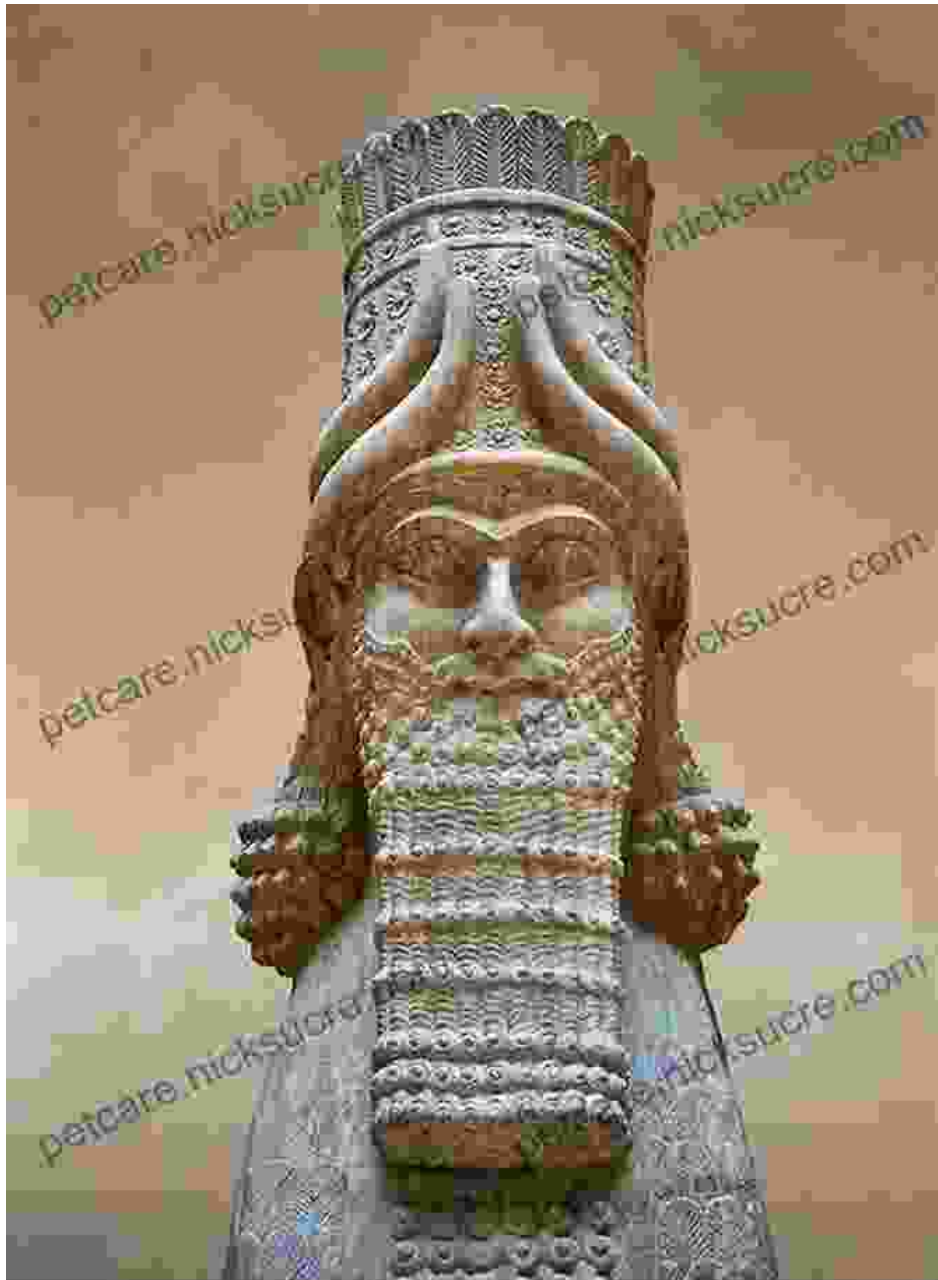
Assyrian winged bull from the palace of Sargon II, 721-705 BCE