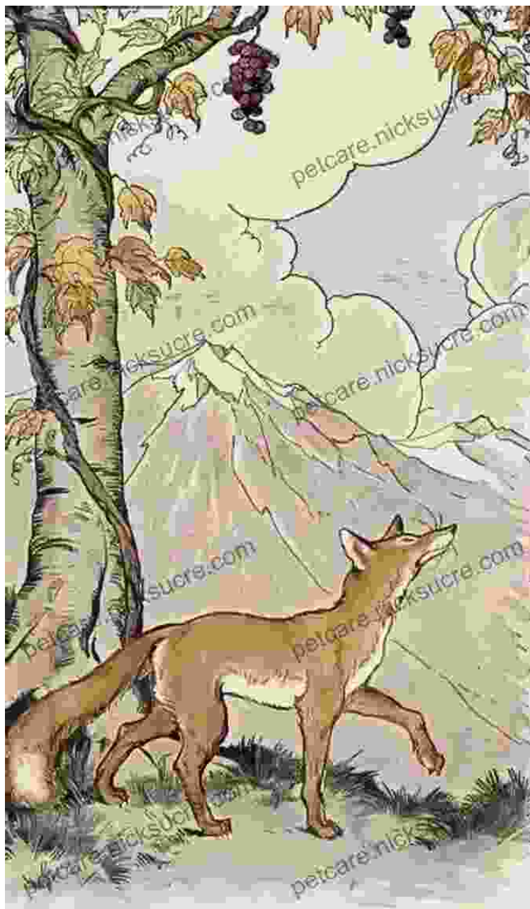
Milo Winter's illustration of Aesop's fable, "The Fox and the Grapes"

Through Winter's illustrations, children can visualize the stories, making them more accessible and memorable. The vibrant colors and imaginative settings captivate young minds, drawing them into the fables' timeless worlds.